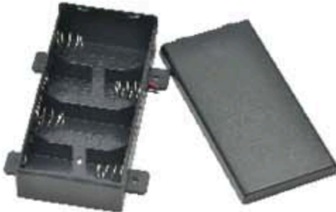
S-143(WBL) FOR FOUR "D" CELLS