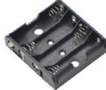
341-3(WBLP) FOR FOUR "AA" CELLS