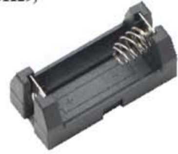
PC123A-2G (KS1129) FOR ONE "123A" CELL