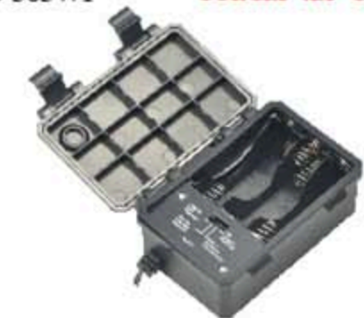
S-363WP FOR SIX "AA" CELLS