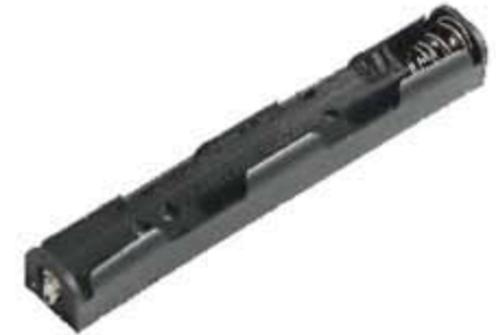
325(WLP) FOR TWO "AA" CELLS