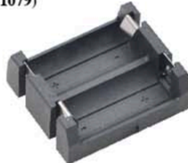
PC123AX2 (KS1079) FOR TWO "123A" CELLS