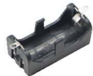
123A-T FOR ONE "123A" CELL