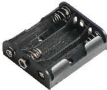
331(WBLP) FOR THREE "AA" CELLS