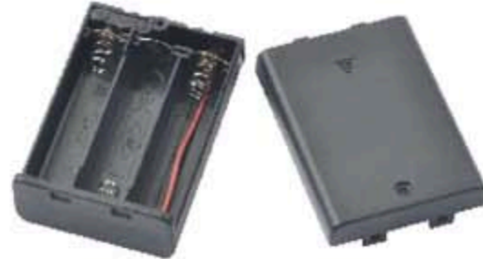
S-331WS FOR THREE "AA" CELLS