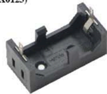
PC123A-5 (BX0123) FOR ONE "123A" CELL