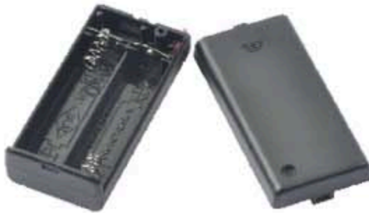
S-321WS FOR TWO "AA" CELLS