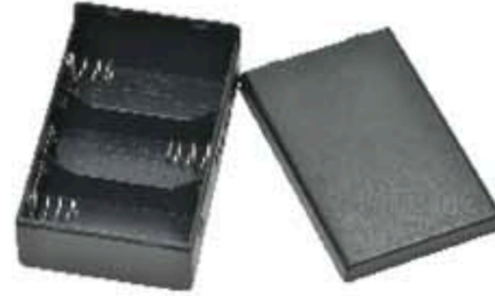
S-131(WBL) FOR THREE "D" CELLS