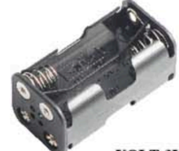
343-3(WBL) FOR FOUR "AA" CELLS