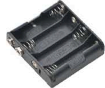
341-1(WBLP) FOR FOUR "AA" CELLS