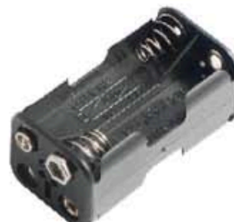
343-2(WBL) FOR FOUR "AA" CELLS