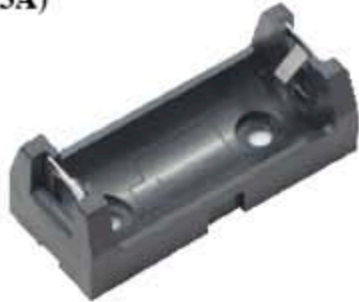
PC123A-3 (6S-2/3A) FOR ONE "123A" CELL