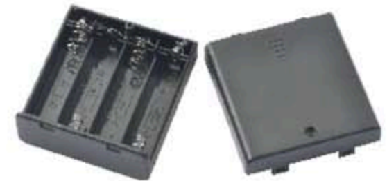
S-341WS FOR FOUR "AA" CELLS