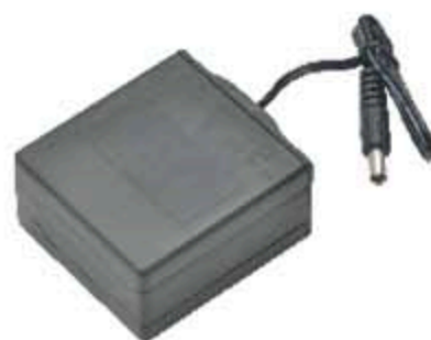
S-383WS FOR EIGHT "AA" CELLS