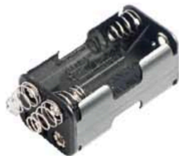
343-1(WBL) FOR FOUR "AA" CELLS