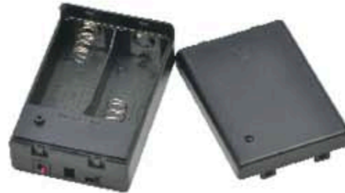
S-221WS FOR TWO "C" CELLS