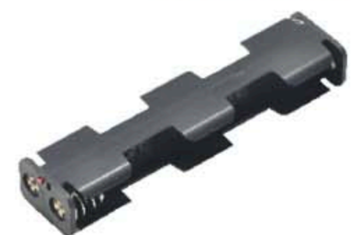
342(WBL) FOR FOUR "AA" CELLS