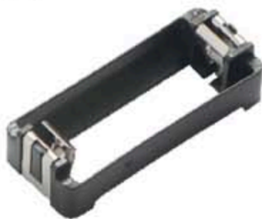
PC123A-6 (BH123A) FOR ONE "123A" CELL