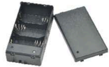
S-131WS FOR THREE "D" CELLS