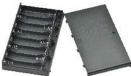
S-381WS FOR EIGHT "AA" CELLS