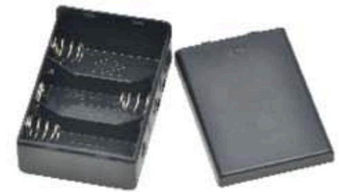
S-231(WBL) FOR THREE "C" CELLS