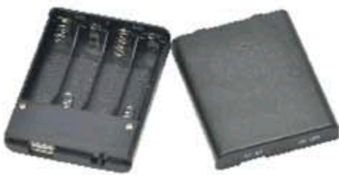
S-341USB FOR FOUR "AA" CELLS