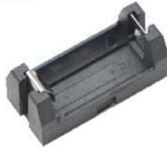
PC123A-2 (KS1019) FOR ONE "123A" CELL