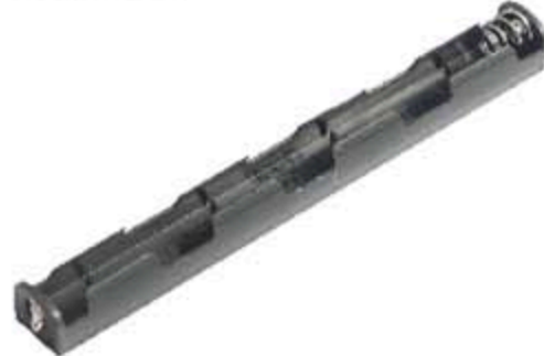
333(WLP) FOR THREE "AA" CELLS