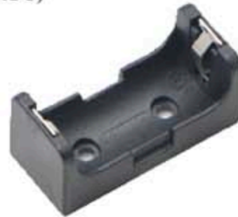
PC123A-4 (BH2/3A-3) FOR ONE "123A" CELL