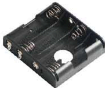
341-2(WBLP) FOR FOUR "AA" CELLS