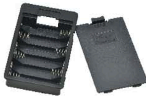
S-361(WBL) FOR SIX "AA" CELLS