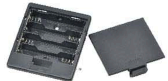
S-441 FOR FOUR "AAA" CELLS