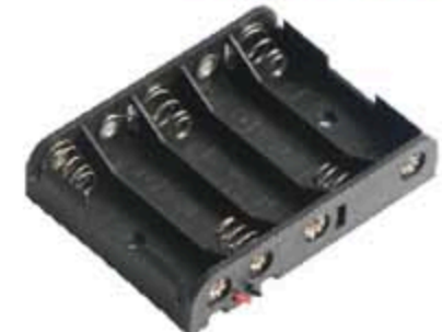
351(WBLP) FOR FIVE "AA" CELLS