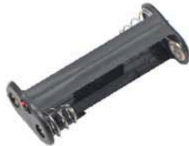
324(WL) FOR TWO "AA" CELLS