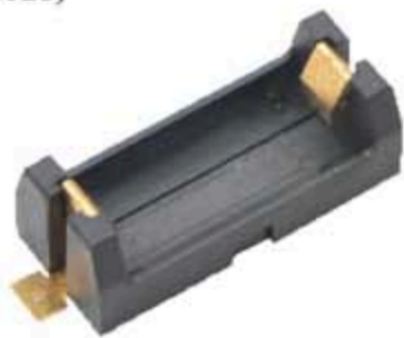
SM123A-1 (KS1018) FOR ONE "123A" CELL