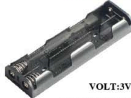
344-2(WLP) FOR FOUR "AA" CELLS