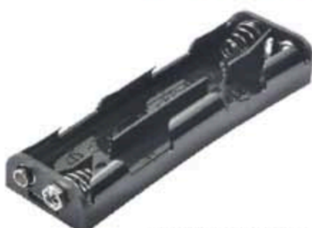
344-1(WBLP) FOR FOUR "AA" CELLS