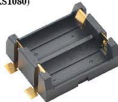
SM123AX2 (KS1080) FOR TWO "123A" CELLS